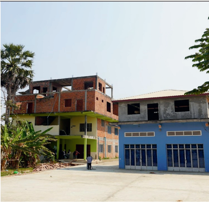
Preacher Training Center, Near Completion