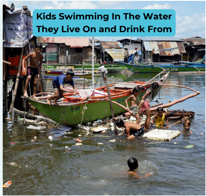
Kids Swimming In The Water They Live On and Drink From

Amidst some of the poorest streets in the world, the slums of Bacoar, Philippines, were further devastated by typhoons, mass fires, and disease. Relief agencies and most mission endeavors, feeling overwhelmed by the chaos and magnitude of the devastation, withdrew to the suburbs. The pain of the poor multiplied as they were abandoned by most who had served these people for years.