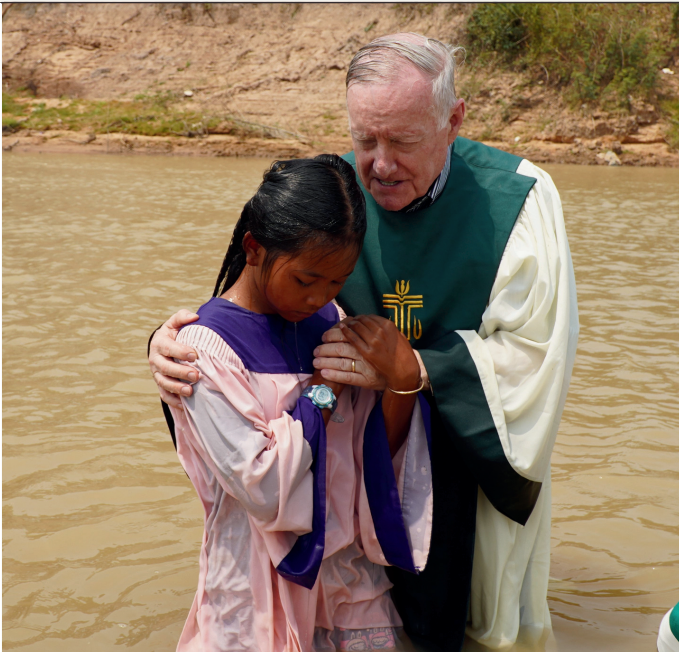
Russell Baptizes Girl Into Jesus Christ