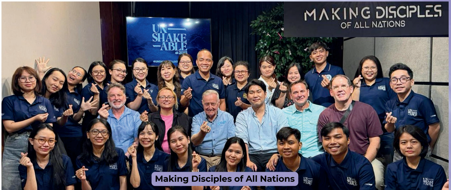
Making Disciples of All Nations