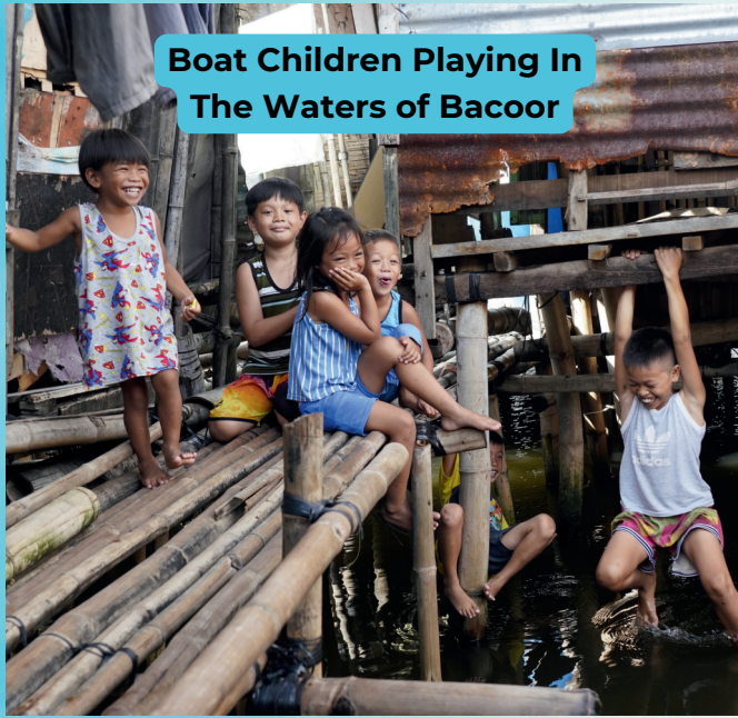
Boat Children Playing In The Waters of Bacoar