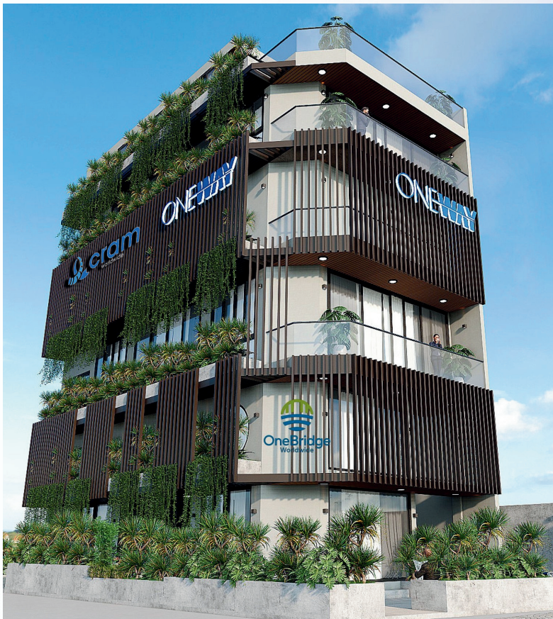
Architect's Rendering of 6 Story Building

This new building will be used to train future leaders. Please pray these leaders will reach 1000's for the Kingdom of Jesus Christ.