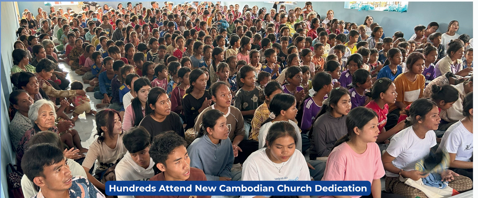
Hundreds Attend New Cambodian Church Dedication

Cambodia is a beautiful nation of remarkable people who have a rich heritage in farming, ancient architecture, hospitality and small family businesses. From 1975-1979, this tranquil nation came under a vicious attack from the Communist Dictator Pol Pot and the Khmer Rouge. Over 3 million of their 13 million people were slaughtered. Cambodia is now littered with large mass graves from this wicked assault on the decent people of this country. Historians now refer to these tragic years as the “Killing Fields.” Today, millions have a hungry heart for the Resurrection Spirit of Jesus Christ.